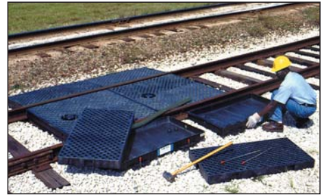
Modular Design Center and Side Pans are 53.5" long; containment areas can be easily assembled to any length desired.

Ultra-Track Pans are available in two (2) models: