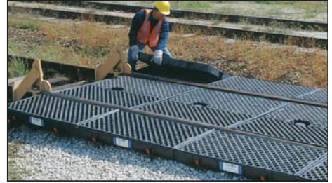
(1) Track Pans with Grates, No Covers

Ultra-Track Pans are available in two (2) models: