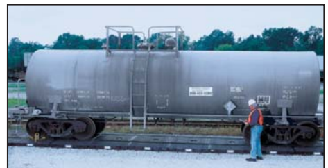
Modular Track Pans can be assembled in any desired length — additional Pans can be added as your containment needs grow.