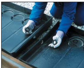
Flow-through channels — All Pans are connected “end-to-end” with bulkhead fittings, and a 3-inch diameter flow-through channel.