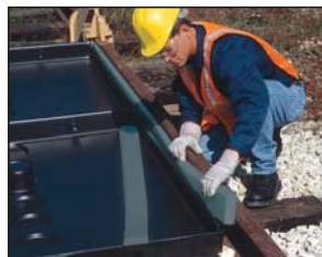
Closed-cell, polyethylene gaskets are then installed to provide a seal between the Pans and rails. (Black gaskets are provided.)