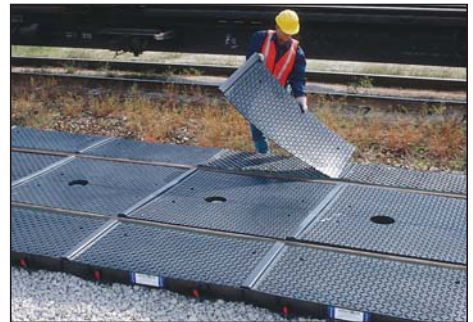
(2) Track Pans with Grates and Covers