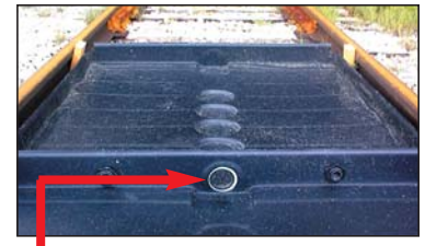
Large, 3”-diameter flow-through channels allow spills to quickly travel from one pan to the next. Channels are located at the low point in each Center and Side Track Pan.