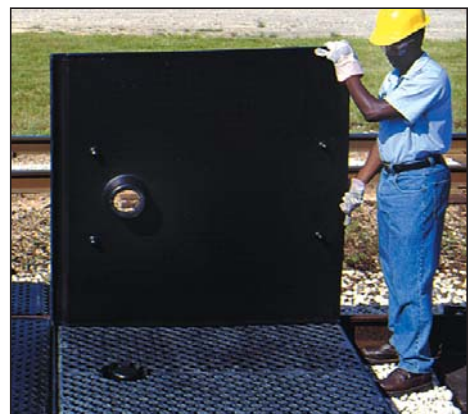
Cover for Center Track Pan Part# 9580