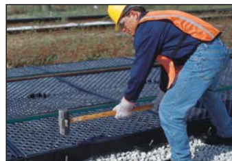
Side Pans are secured in place with rebar or other fasteners. (2-foot-long rebar fasteners with protective caps are available as options.)