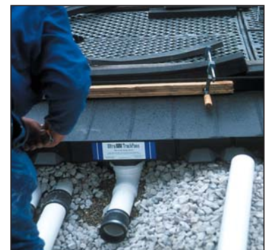
All Center and Side Track Pans are molded with pipe fitting locators at their lowest point. Below-grade piping can be installed to channel large spills to oil/water separators, holding ponds, etc.

U.S. Patent Nos. 5,562,047; 6,173,856; 6,305,569