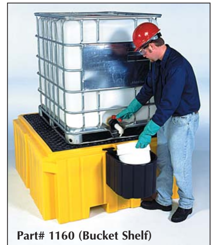
Part# 1160 (Bucket Shelf)

Five inner polyethylene columns support uniformly distributed loads of up to 8,500 lbs. All components are easily removed for cleaning.