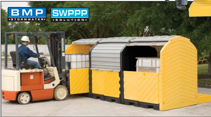
3-Tank Model: 355 Gallon Capacity (Part# 1166)