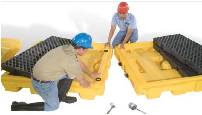
Pallet to Pallet connection