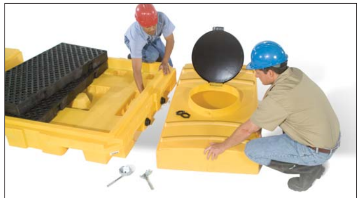
Pallet to Expansion Tank connection