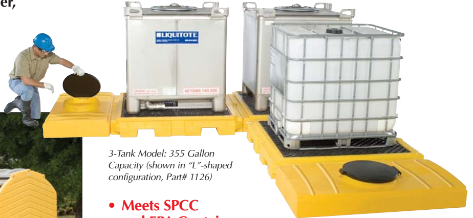
3-Tank Model: 355 Gallon Capacity (shown in “L”-shaped configuration, Part# 1126)