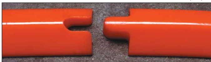
Interlocking end joints help create longer lengths and are self-sealing.