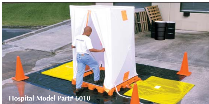
Hospital Model Part# 6010

The Single Station Field Decontamination System™ was developed to improve field delivery of technical and tactical decontamination for responders. The system provides for multiple washes and rinses on a single containment platform — eliminating the need for multiple containment pools. Set-up time and staffing are reduced significantly using this process and workers are never expected to stand in contaminants.