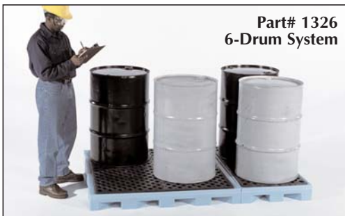
Part# 1326 6-Drum System