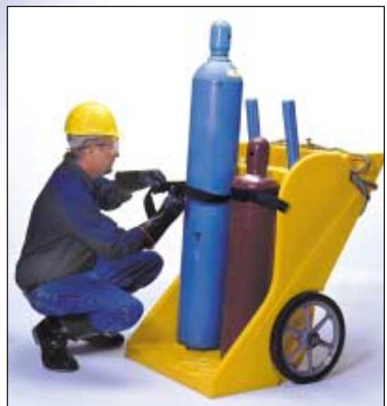
Heavy-duty, 1 1/2” wide safety straps keep cylinders secure during transport and storage. Molded-in cylinder “stops” on base mechanically “lock” cylinder bottoms in place.