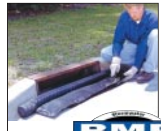
U.S. Patent No. 5,632,888