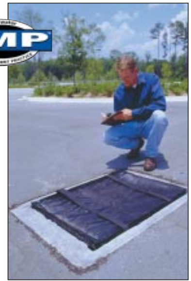
U.S. Patent No. 5,725,782