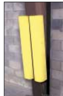
Molded groove simply slides onto I-beam, grips securely.