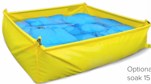
Optional staging pool can soak 15 bags at a time