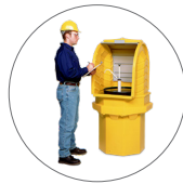
Ultra-Hard Top P1 Plus