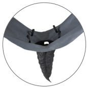
Ultra-Drain Guard, Heavy Metal Model