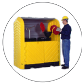
Ultra-Hard Top Plus