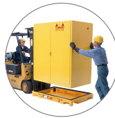
Ultra-Safety Cabinet Bladder System