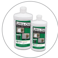
Ultra-Oil Stain Remover