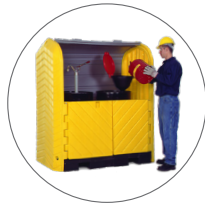
Ultra-Hard Top Plus