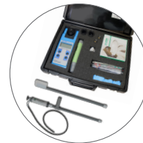
Ultra-Sampling Kit, Universal Sampler