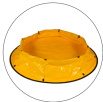
Ultra-Pop Up Pool