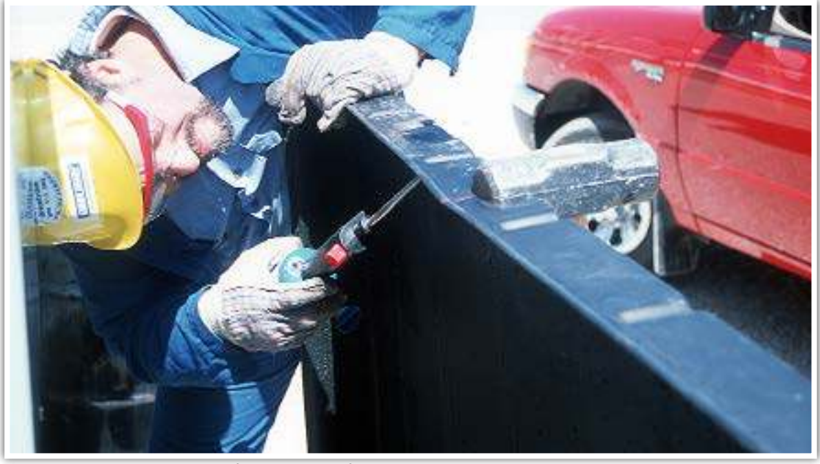
Pan customization (if needed)