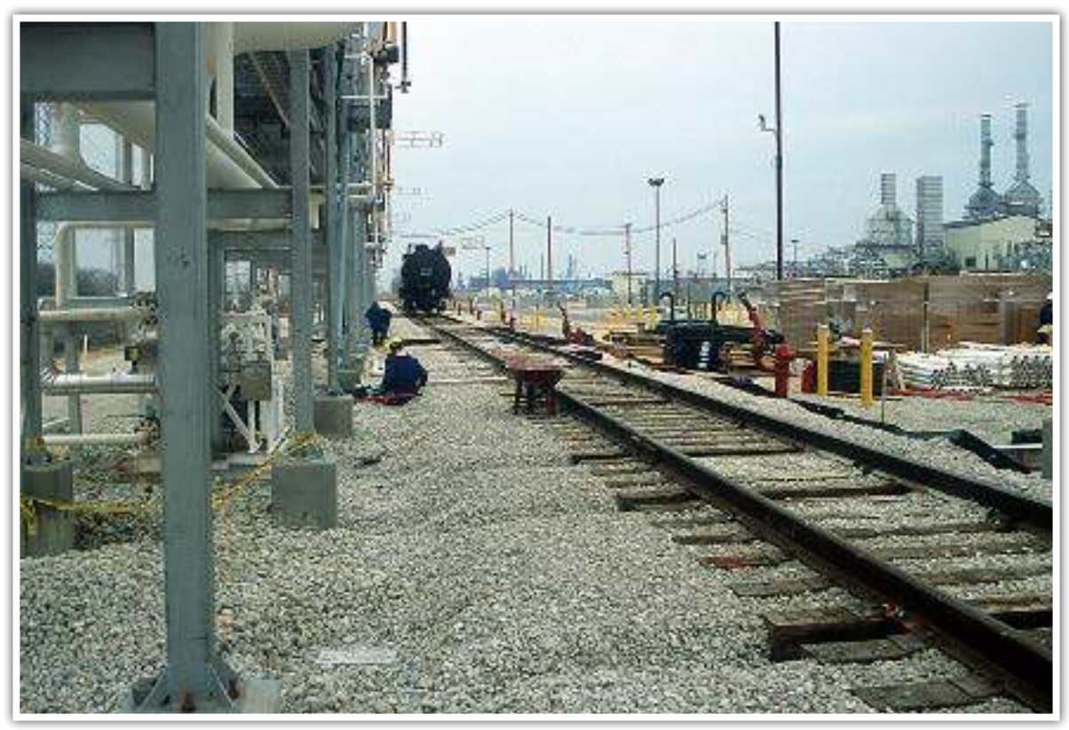
Facility siding prior to installation