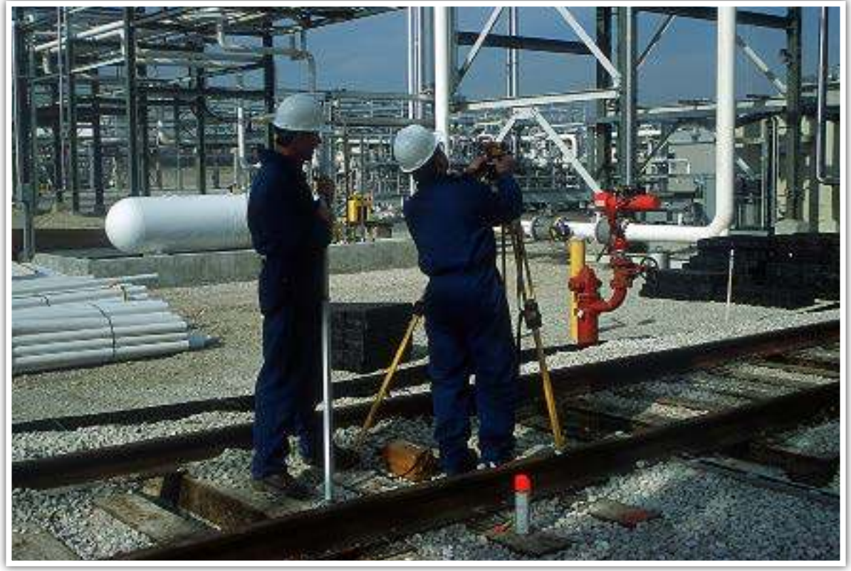
Survey to design correct slope for piping