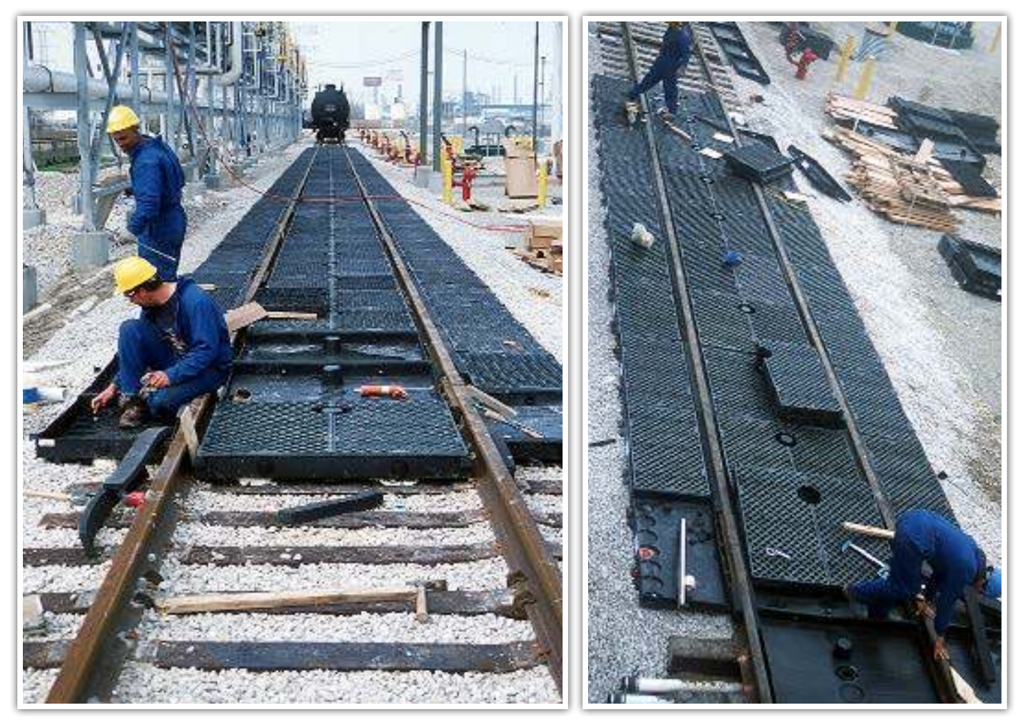
Late stage installation