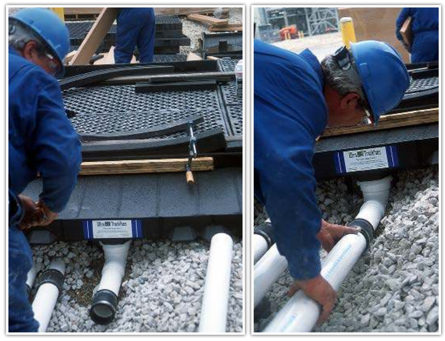
Connect pipes to Pans